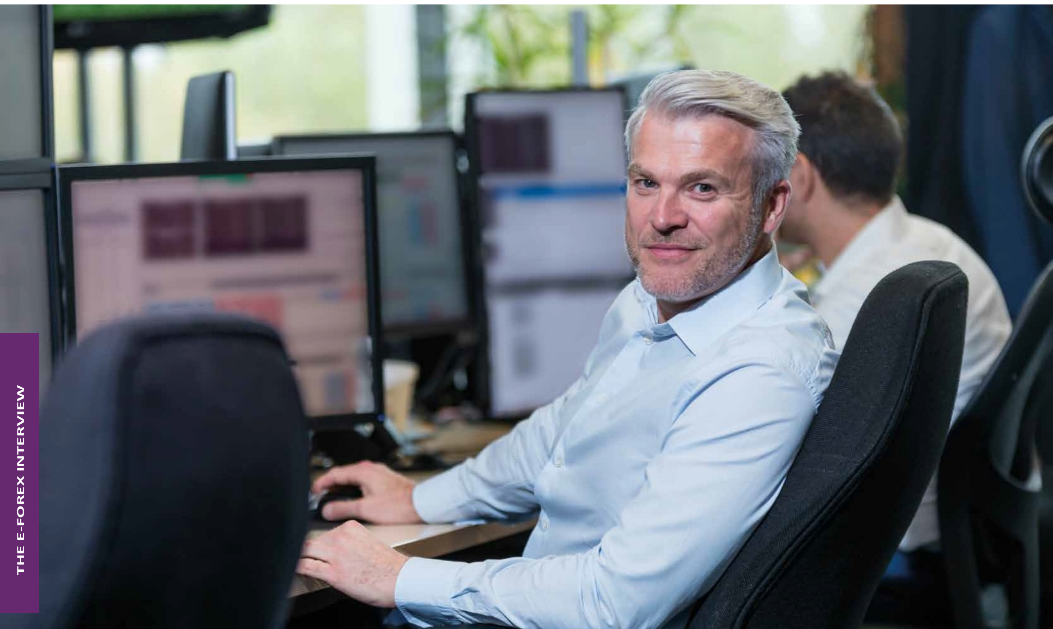
With clients in 100 different countries and 11 offices worldwide, we remain in expansion mode

see more initiatives around using the blockchain technology itself, you will need digital assets to be transferred on those blockchains. But that's not going to happen overnight and it might be five years until we see this happening. I honestly think we will all be trading digital dollars, digital yen, maybe bitcoin in five years from now, and using blockchain technology.