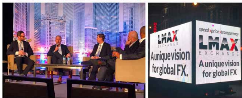
LMAX Exchange empowers traders to understand 100% of execution costs